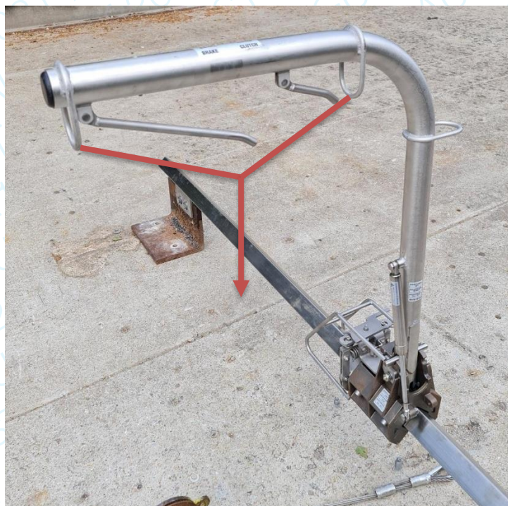
Figure 1 – Anchor device described as “TRAM Safety System”

Samples were tested as received, and were not subject to any pre-conditioning processes other than those stated in individual test clauses